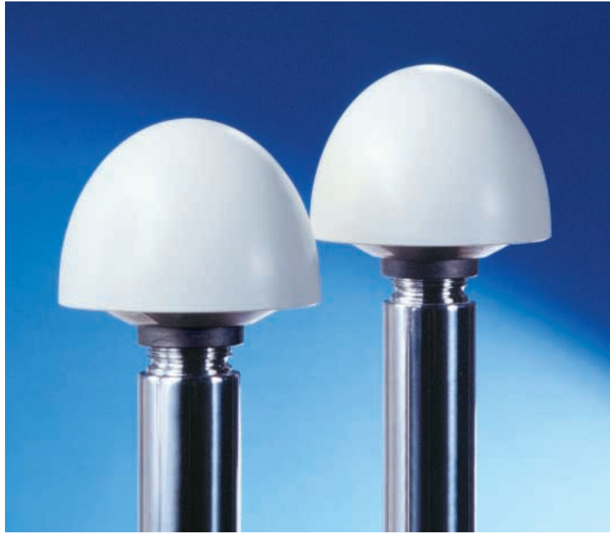
Bullet III HE jam-resistant active GPS antenna

The F-type or TNC antenna connector is located inside the threaded socket, which allows the antenna cable to be routed inside the pole and protects the cable connection for added reliability.